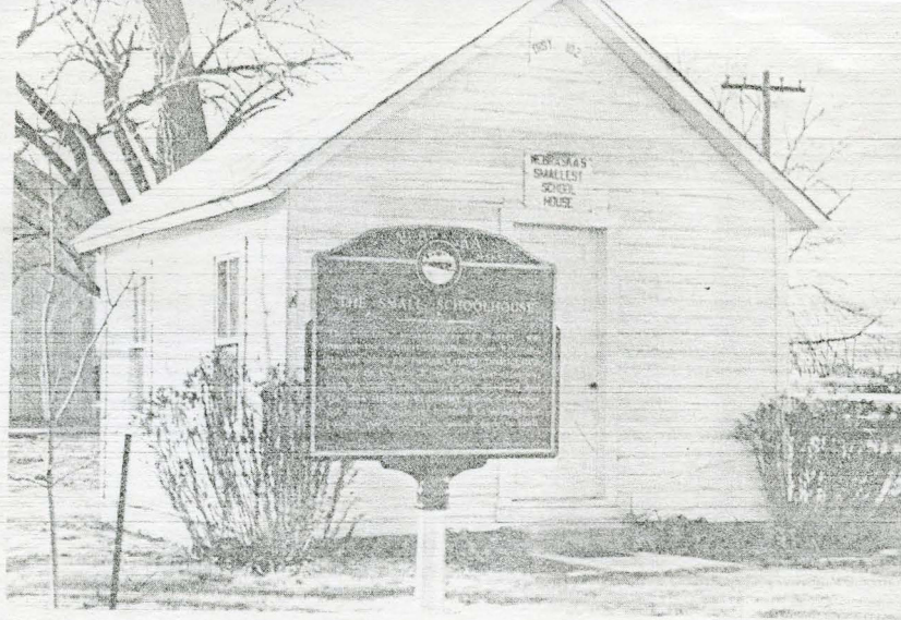
A single-post state historical marker, measuring 30 by 42 inches and designed for reading by pedestrians, was erected in Edison, Furnas County, to commemorate one of the smallest schoolhouses in Nebraska.