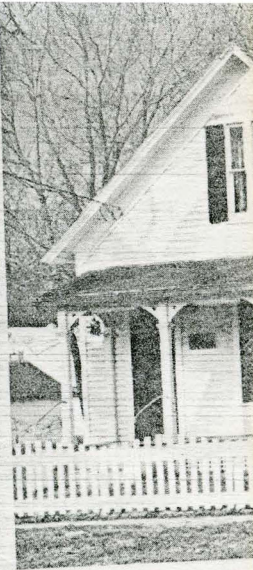
The Willa Cather House, dedicated to the Nebraska Pioneer Memorial Museum, it will be a part of the Foundation will no programs.