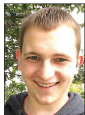
BY AUSTIN KOELLER News Staff

When you can't get in, 'inaccessible' is not just inconvenient