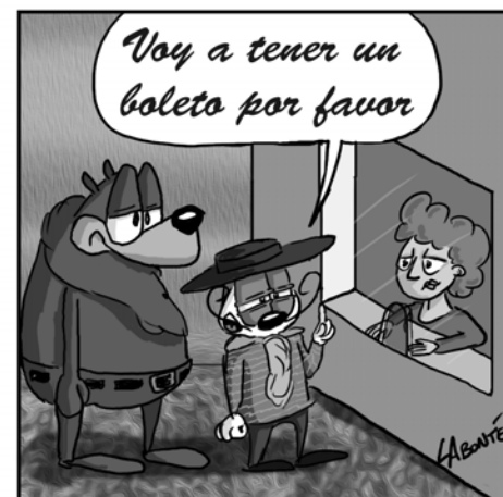
For more comics and animations visit FilbertCartoons.com