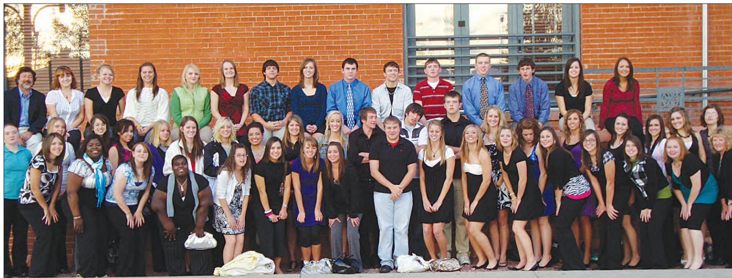
Over 50 Thompson Scholars traveled to Denver during Fall break. The Thompson Scholars Learning Community lives together in Mantor Hall.

Thompson Scholars take classes together, are provided one-on-one mentoring and assistance, attend study hours and have the opportunity to do undergraduate research projects, for which they receive a stipend upon completion. In addition, students participate in campus events and philanthropic activities in the community.