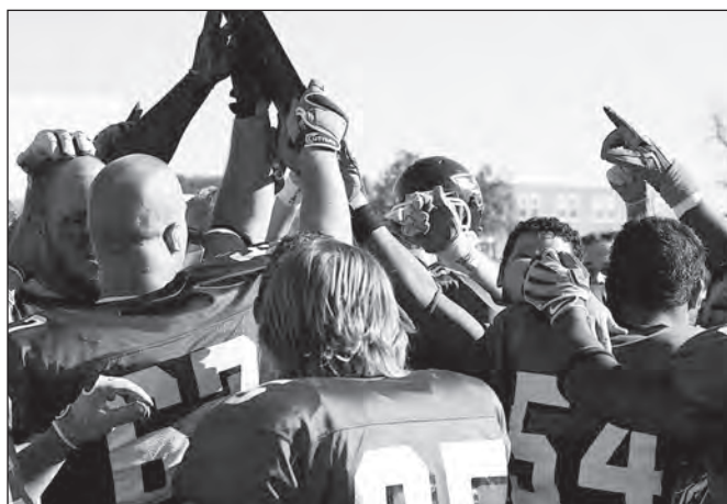
Players hold up an RMAC championship trophy Saturday after defeating the Colorado School of Mines 24-12. The Lopers, now seeded fourth in their region, are in a prime position to make their first postseason game since 2005, a loss to Pittsburg State out of Penn.

rankings in the final week of the season though, the Lopers would be set to face off against Hillsdale College in Michigan for the first round of the playoffs. A win there would propel the Lopers into a trip to the University of Minnesota-Duluth for a match up with the Bulldogs.